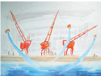
Water Crane Ballet a gaggle of giant cranes perform a riotous water ballet Melbourne Docklands Turpin Crawford Studio © 2002

A gaggle of giant cranes perform a riotous water ballet at the Bolte Bridge end of Melbourne's Docklands. Reminiscent of the area's history as a working harbour, the cranes perform swoops and sweeps that range from the lyrical to the raucous.