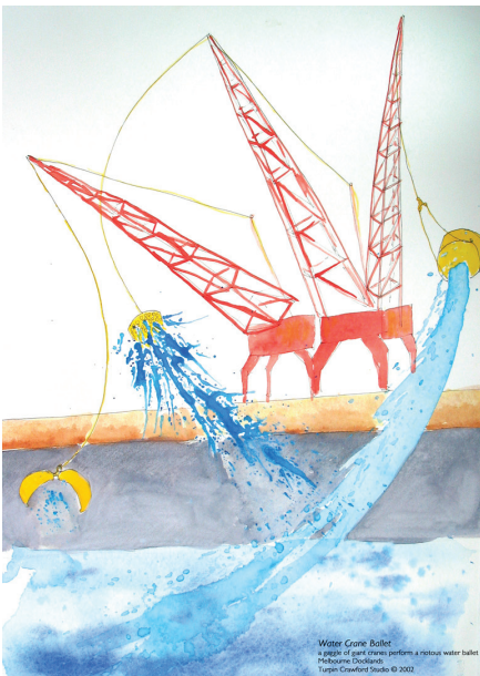
Water Crane Ballet a gaggle of giant cranes perform a riotous water ballet Melbourne Docklands Turpin Crawford Studio © 2002