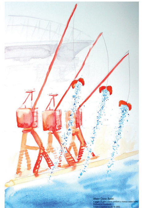
Water Crane Ballet a gaggle of giant cranes perform a riotous water ballet Melbourne Docklands Turpin Crawford Studio © 2002